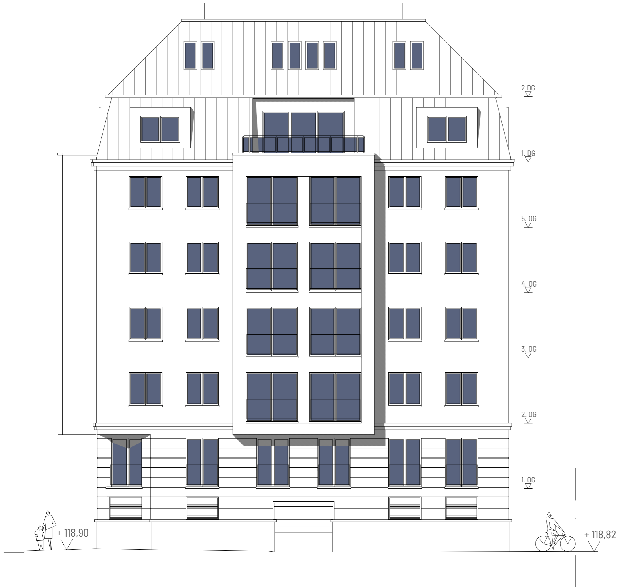
Richard-Lehmann-Str. 47 Ansicht Ost